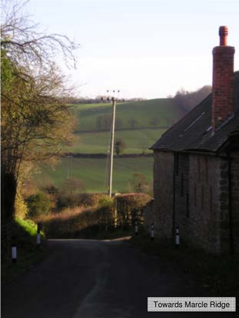
Towards Marcle Ridge