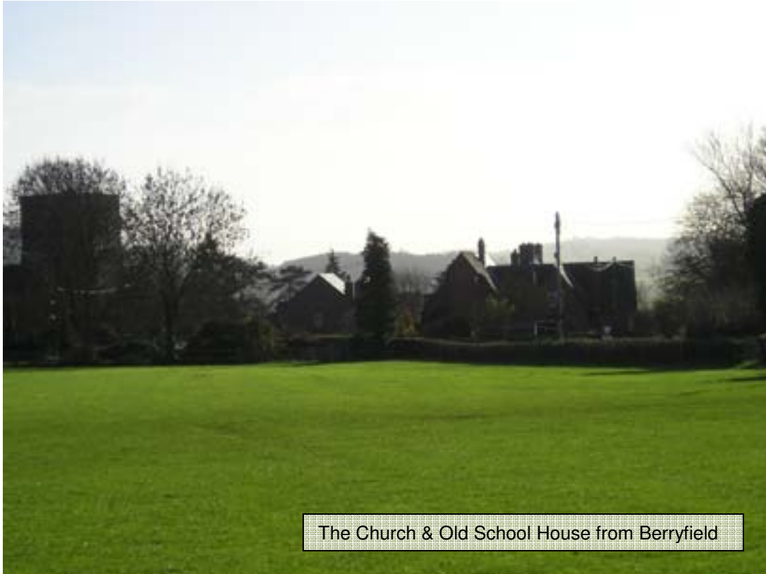
The Church & Old School House from Berryfield

Production of this Plan has been supported by Herefordshire Council and the Lotteries Board Awards for All